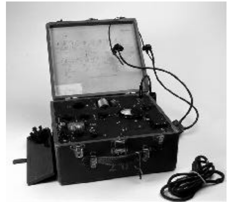
OSS suitcase radio on display.